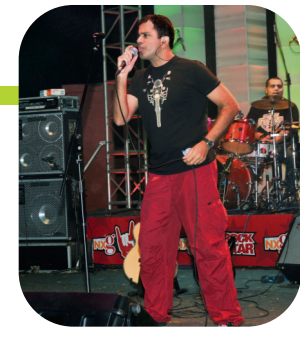
ILLUSTRATION: SATHEESH VELLINEZHI

Wabi Sabi, Hidesign's latest collection, is crafted from non-printed, full-grain leather that undergoes vegetable tanning. Shop waist bags, utilitarian tote bags and briefcases, starting ₹3,795, on hidesign.com. From leather bags to footwear, the summer edit by Brune & Bareskin has leather sliders and flip-flops for men. Starting at ₹4,499, the collection is available on